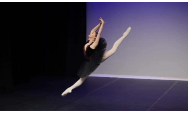
48th Prix de Lausanne international ballet competition is on